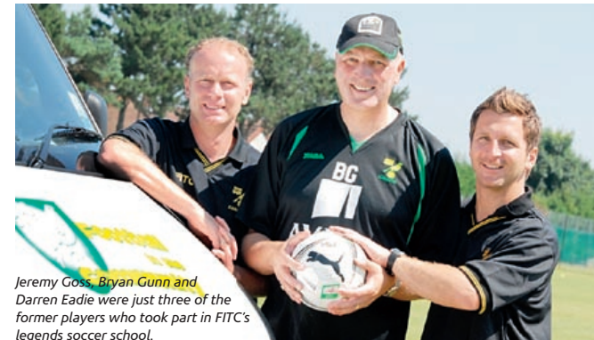
Jeremy Goss, Bryan Gunn and Darren Eadie were just three of the former players who took part in FITC's legends soccer school.

Goss, Bryan Gunn and Craig Fleming. Ex-City player Neil Adams commented, "It's great to see the enjoyment that the kids here get from it. There's an amazing amount of kids and walking around you see the many different activities that FITC have put on for them."