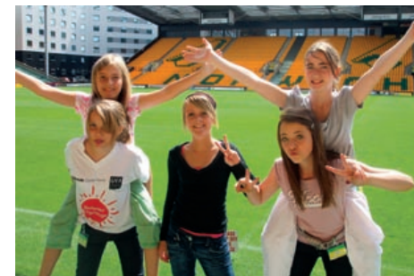
A group of youngsters enjoy the Study Centre's summer challenge.

The Norwich City Study Centre kicked off the school holidays in style by holding their annual summer challenge in July. As part of the University for the First Age scheme, Children from Framingham Earl, Taverham and Sprowston High schools, along with youngsters from Kinsale Junior School joined forces to create their very own 'pop mime' video to the song "Perfect Day".